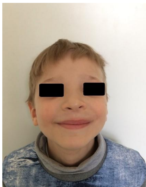
Figure 1 Dysmorphic facial features of the patient at the age of 6: a broad flat nose, down slanting palpebral fissures, hypertelorism, and mild ptosis are noted (permission of parents to publish the picture was obtained).

The patient was treated according to NOPHO ALL-2008 clinical trial protocol. To date, the boy is on maintenance therapy and is alive in remission 2 years after diagnosis.