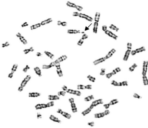
Figure 2 The marker chromosome revealed by conventional karyotyping at the age of 3 before pre-B-ALL developed is indicated by an arrow.

6.6 Mb duplication in the 22q11.1q11.22 (hg[19]: chr22:16079545-22701051) region (Figure 3) and delineated the marker chromosome. Parental SNP array analysis revealed de novo origin of the 22q11.1q11.22 duplication in the proband. Duplication 22q11.1q11.22 was identified and assessed as clinically significant.